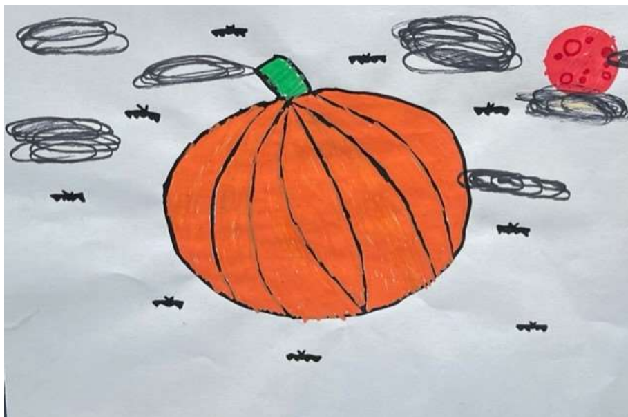
By Ruby Cowan (age 10)